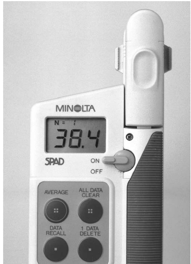
Figure 3. Picture of chlorophyll meter showing function buttons, display screen, and meter head.