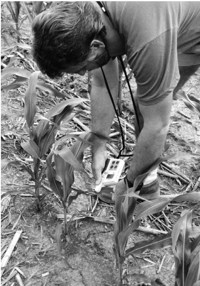
Figure 2. A chlorophyll meter in use.